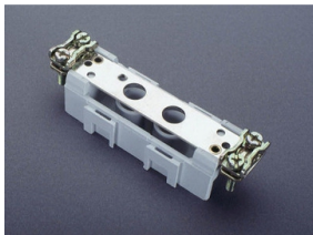
03 620 neutral conductor 160 A cleat, both sides